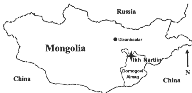
Fig.1: Location of the Ikh Nartiin study area in southeastern Mongolia

Steppe plant communities in Mongolia are complex (Hilbig 1995; Gunin et al. 1999). ASM (1990) described this portion of the eastern Gobi as steppe dominated by needle grasses ( Stipa klemenzii and Stipa krylovii ) and Cleistogenes squarrosa . In the study area, other grasses included fescues ( Festuca spp.), and wheatgrasses ( Agropyron spp.). A tall robust grass, Achnatherum splendens is dominant in gullies or draws. A variety of forbs including wild onion ( Allium spp.), and shrubs such as sagebrushes ( Artemisia spp.), caraganas ( Caragana spp.), salt cedars ( Tamarix spp.), junipers ( Juniperus spp.), currants ( Ribes spp.), and cherry ( Prunus spp.), were common components in plant communities at Ikh Nartiin.