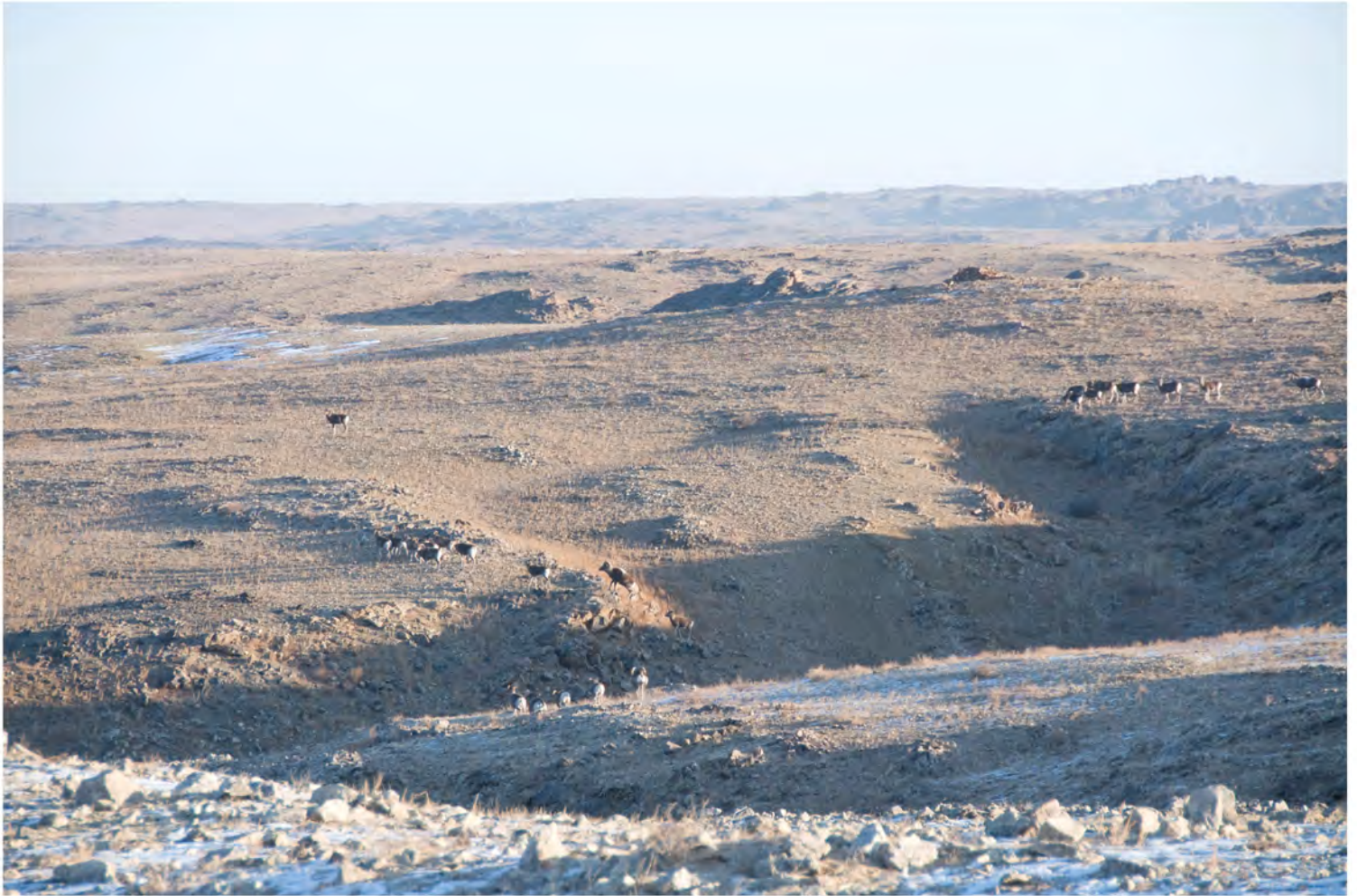
Gobi argali, Mongolia, November 2009

A publication of the August L. Hormay Wildlands Institute, Inc. Prepared for Grand Slam Club Ovis, Safari Club International Foundation, and Mongolian Ministry for Nature, Environment and Tourism.